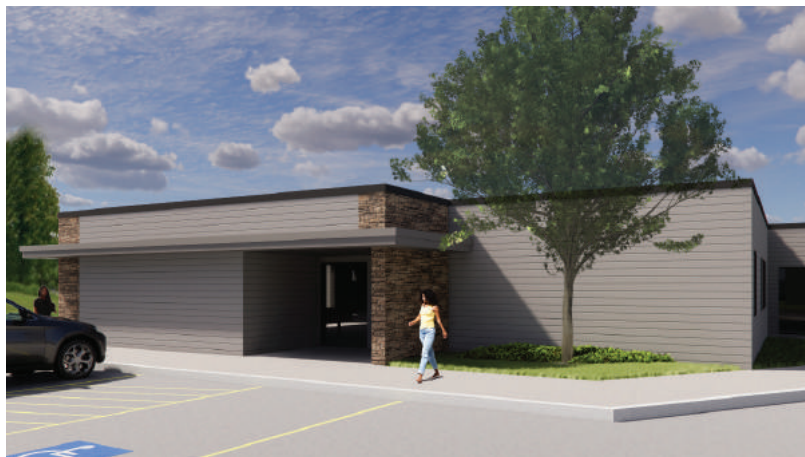
New Specialties Practice building, set to open February 2024.

With the new team, CMH required additional patient care space to accommodate the growing practice. With this, a state-of-the-art orthopedic practice is slated to open on the hospital campus in the former Mid-York Building, which is scheduled for early 2024. This facility will also host other visiting specialists, as the Community Memorial Leadership Team actively recruits other essential providers to meet the diverse needs of patients.