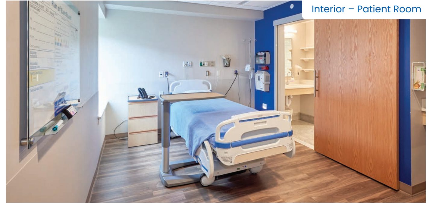
Interior - Patient Room