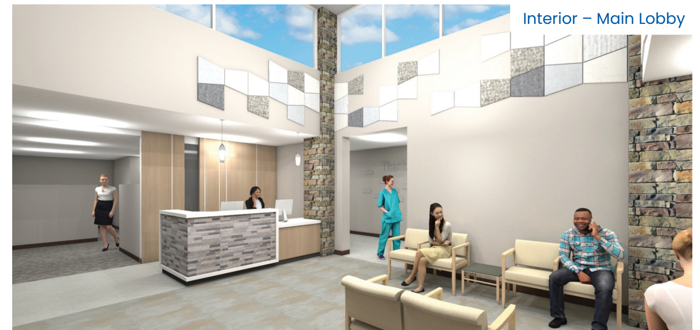
Interior - Main Lobby