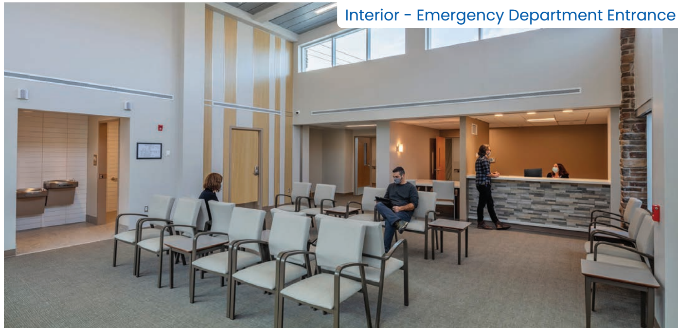
Interior - Emergency Department Entrance