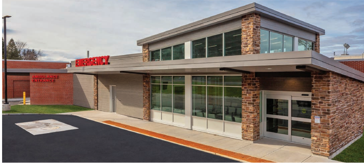
Exterior - Emergency Department Entrance