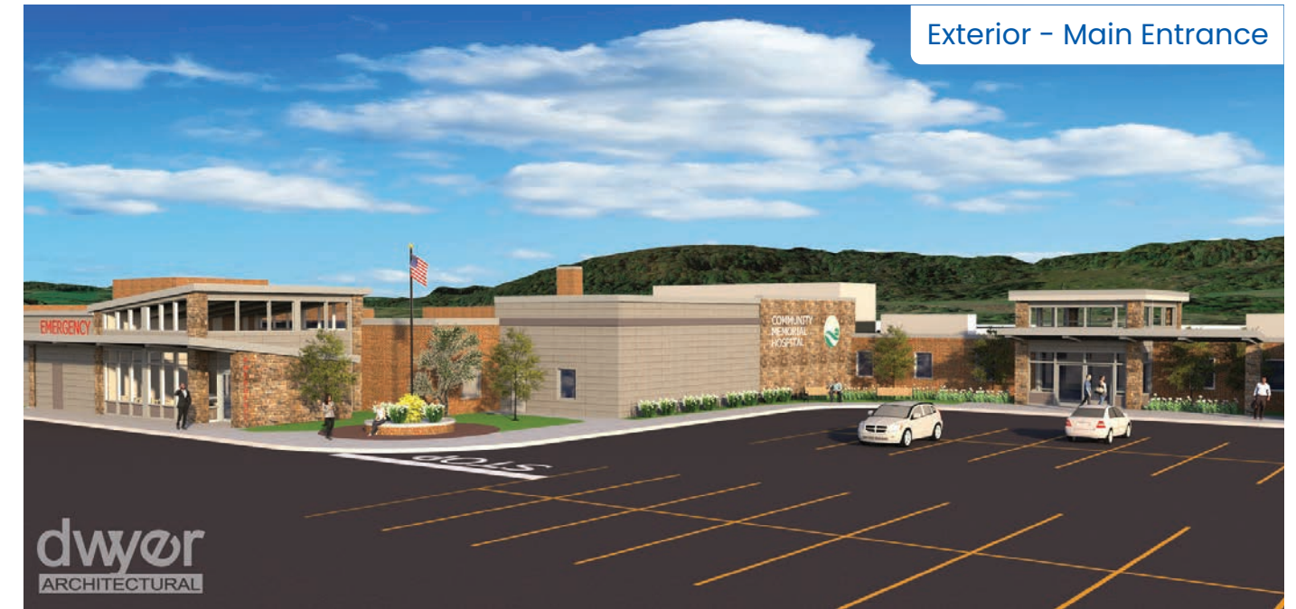
Exterior - Main Entrance